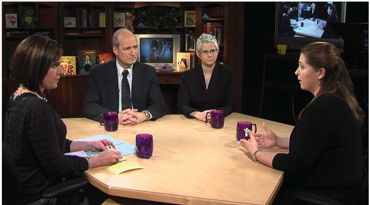
Expert panelists discuss emergency preparedness

The need for emergency preparedness before and after tragic events has never been more urgent. In late fall 2012, PDP’s Early Childhood Education and Training Program planned what turned out to be a very timely videoconference program to help childcare providers better prepare for emergency situations. Originally scheduled to air in November, the program date was changed to late December due to Hurricane Sandy. By the time participating childcare providers attended the conference, many had suffered the effects of the storm themselves, and were eager for information to address their