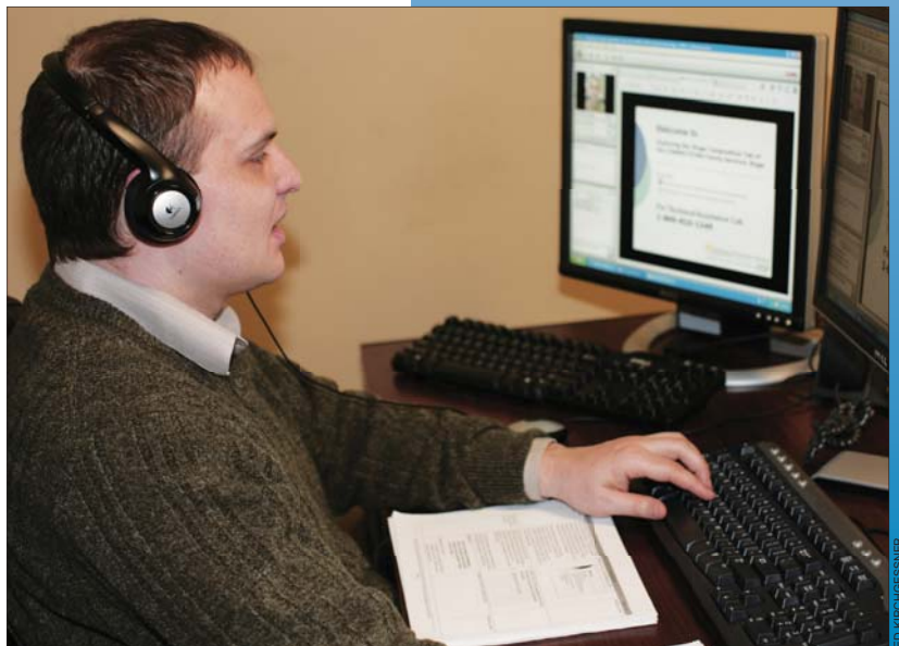
Learner participating in an asynchronous, web-based training